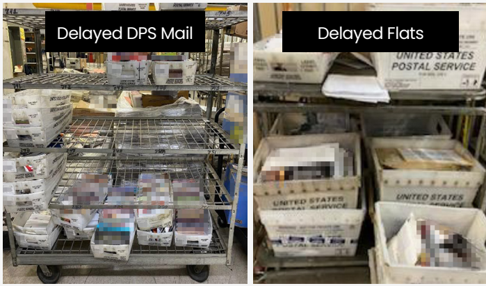
Figure 3. Examples of Delayed DPS Mail and Flats on the Workroom Floor