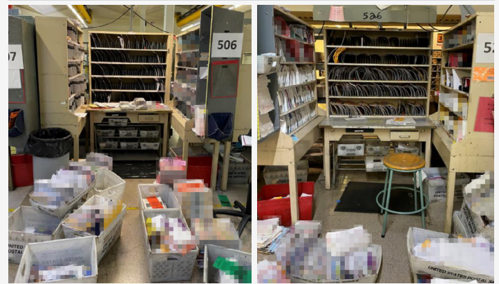
Figure 1. Examples of Delayed Mail in the Carrier Cases